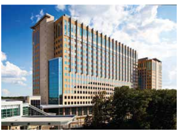
BRAC 133 at Mark Center . HKS