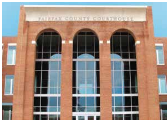
Fairfax County Courthouse . HDR