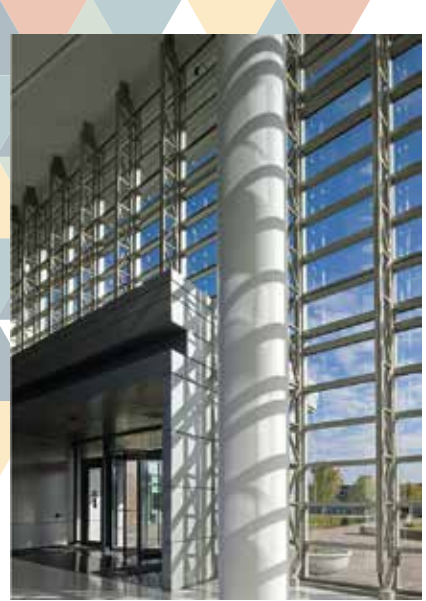
Sheppard Hall at Joint Base Andrews