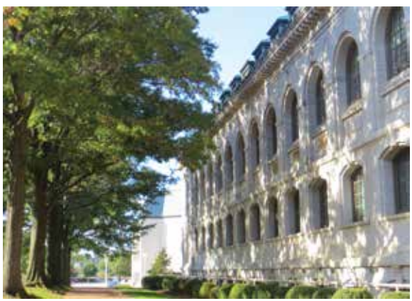
US Naval Acadmy-Maury Hall . Ernest Flagg