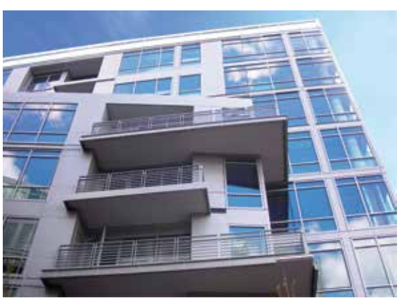
WestEnd25 . Shalom Baranes Associates