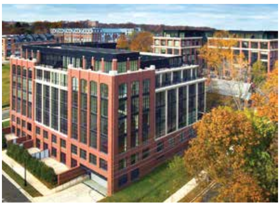
Wooster and Mercer Lofts . Cunningham Quill Architects